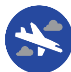
Airport handling and intermediate storage