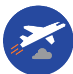
Airport handling and intermediate storage